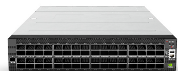
SN5600 switch image